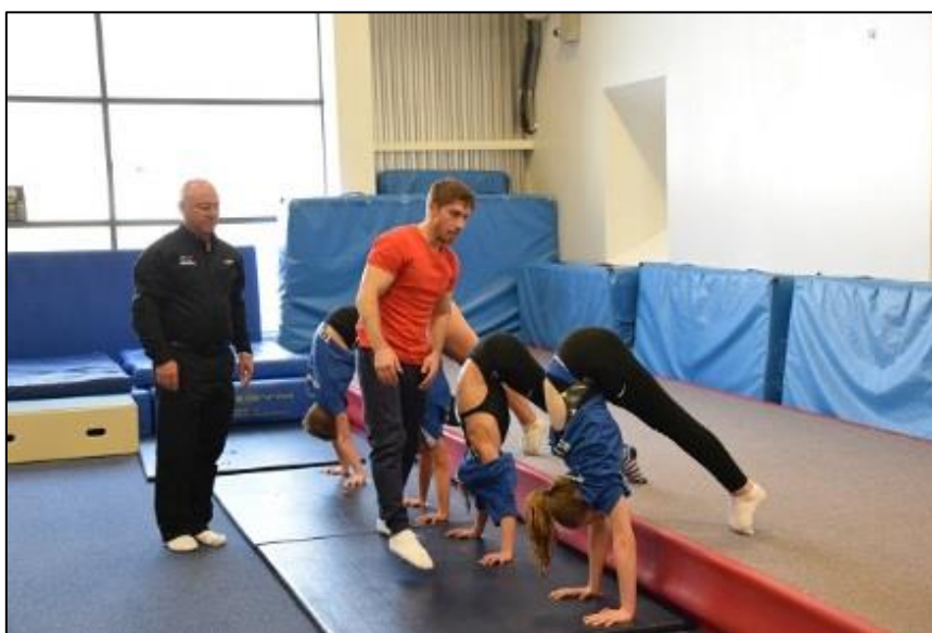
Above: Divers helping to demonstrate during the Regional Diving Coaching Conference.