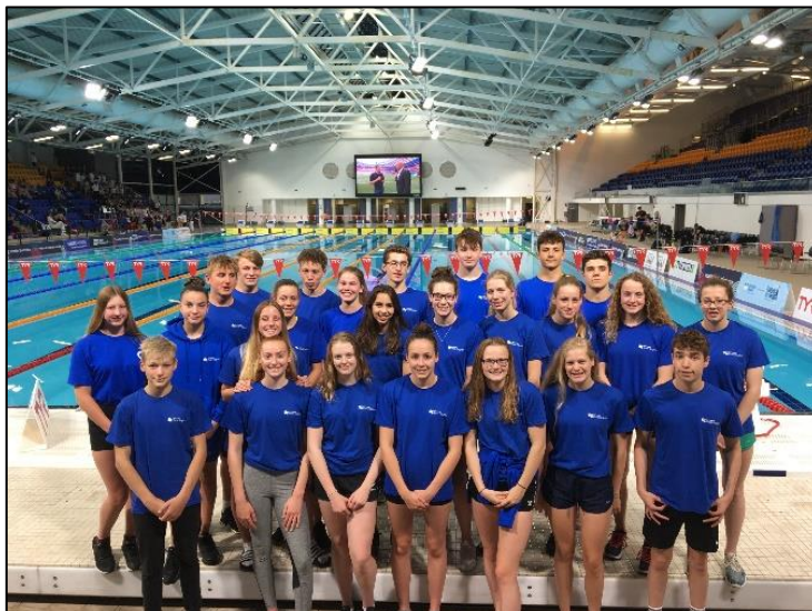
Above: The selected squad for the international meet 2018 at the Scottish Open.